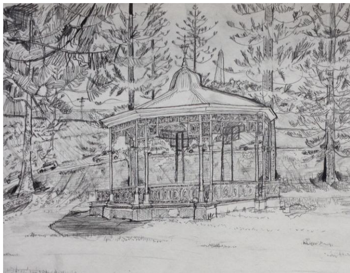
The Rotunda, King Edward Park 2014