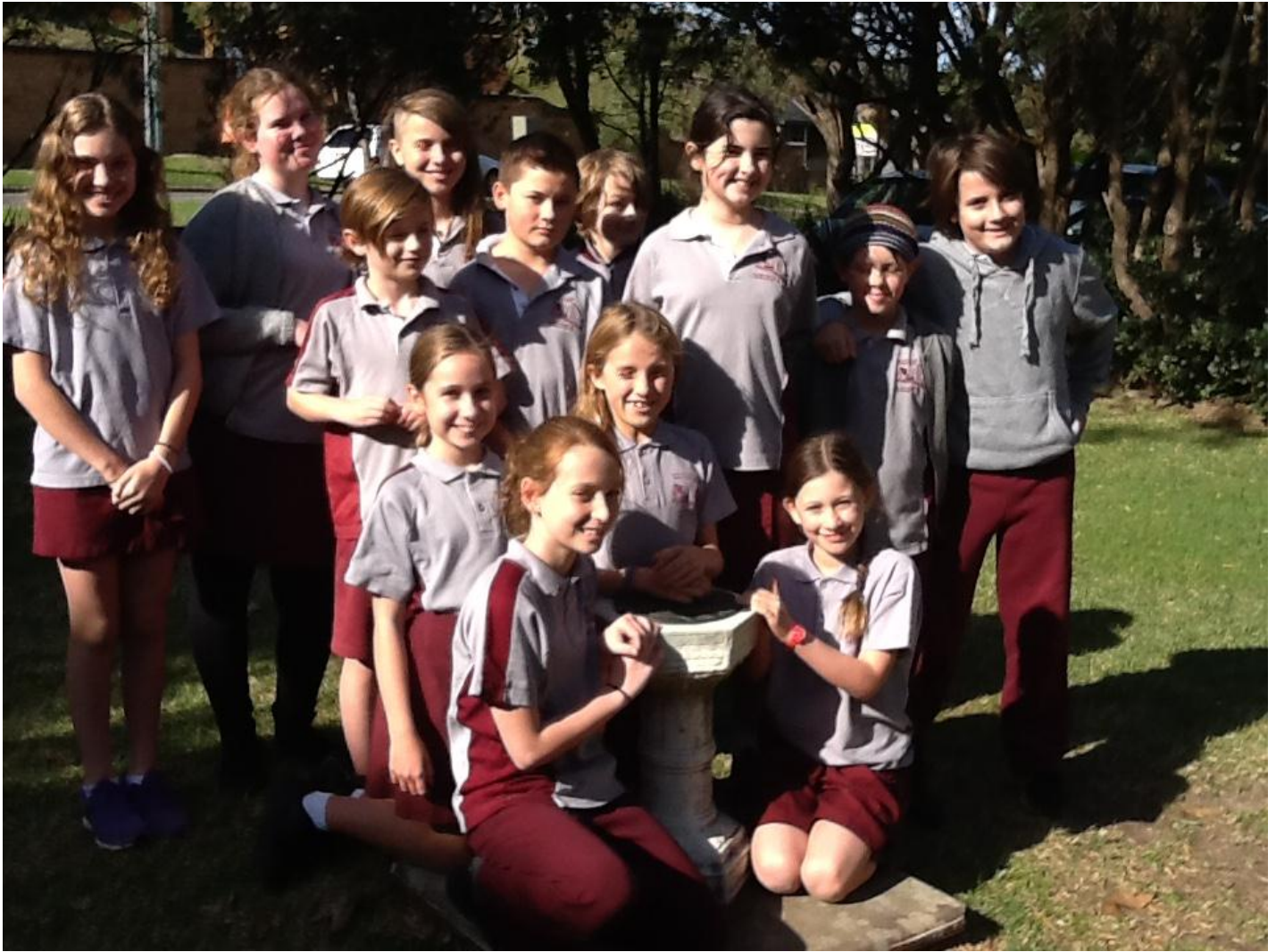
Picture: Premier's Debating Team and Train-on Debating Team 2015 (Absent: Evie)